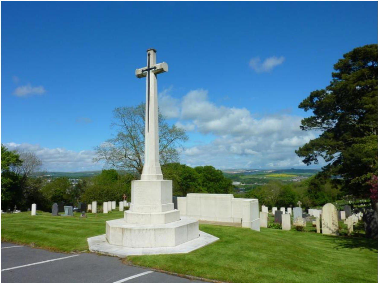
Cross of Sacrifice in Efford Cemetery, Plymouth